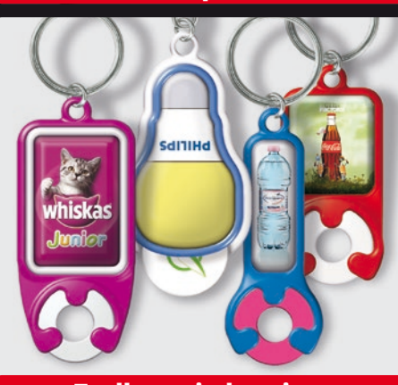
Trolley coin keyrings