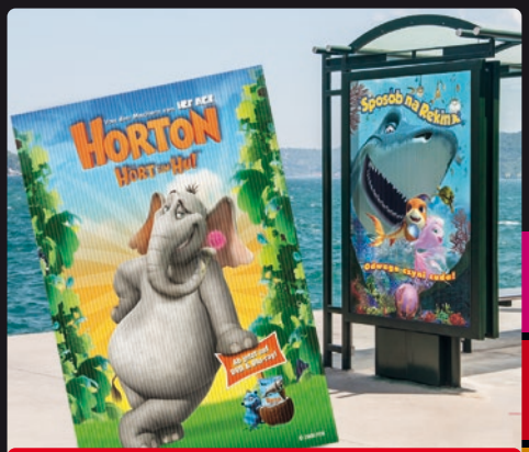
Lenticular panels XXL