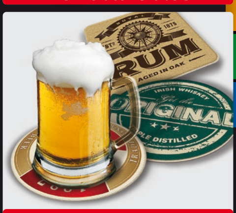
Beermats and coasters