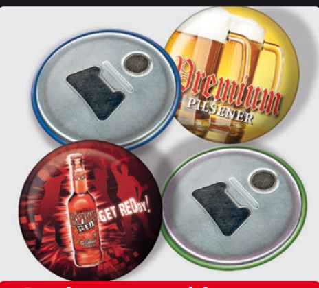
Bottle openers with magnet